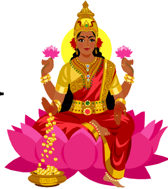
Aspects of India