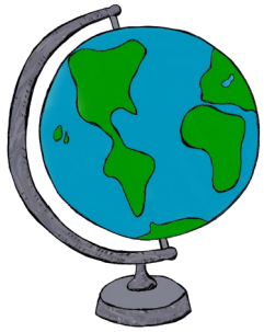
Where in the World?