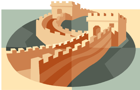
China, circuits & storms